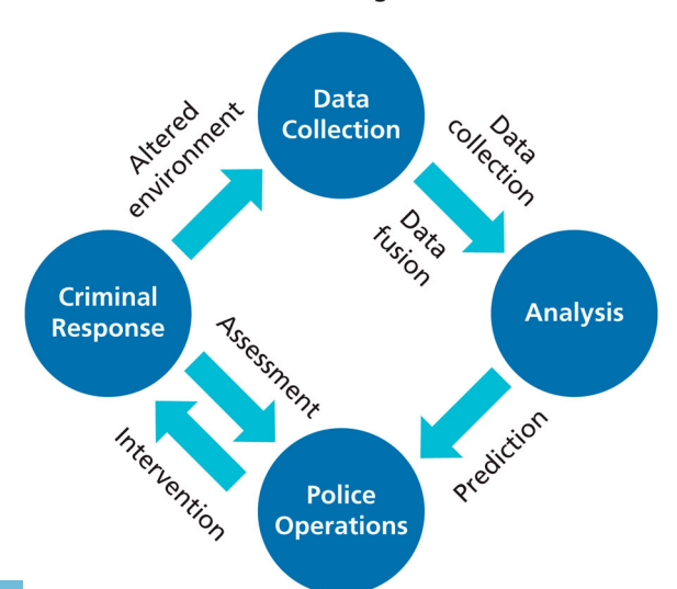
The Prediction-Led Policing Business Process

The underlying model of predictive policing is represented in Figure 1. As Perry et al. (2013, p. 128) point out, predictive policing is 'not fundamentally about making crime-related predictions' but about implementing a prediction-led policing business process , which consists of a cycle of activities and decision points: data collection, analysis, police operations, criminal response, and back to data collection. At each stage of the cycle, choices are made regarding, for example, the types of data to collect, the duration and frequency of data collection and update, the types of analytical tools to